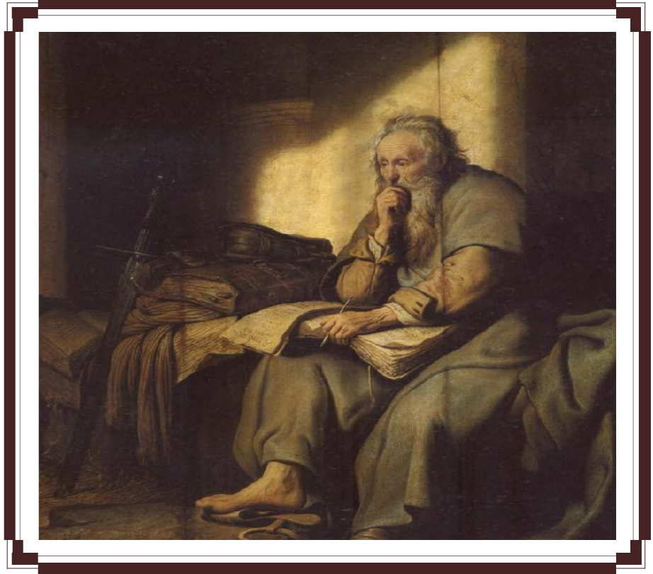
The Apostle Paul in Prison by Rembrandt

501-7 Mitchell Street • Atlanta, Georgia 30314 (M. L. King Jr. Drive, SW & Northside Drive) Office 404.524.4263 Fax 404.524.4344 www.centralumcatl.org