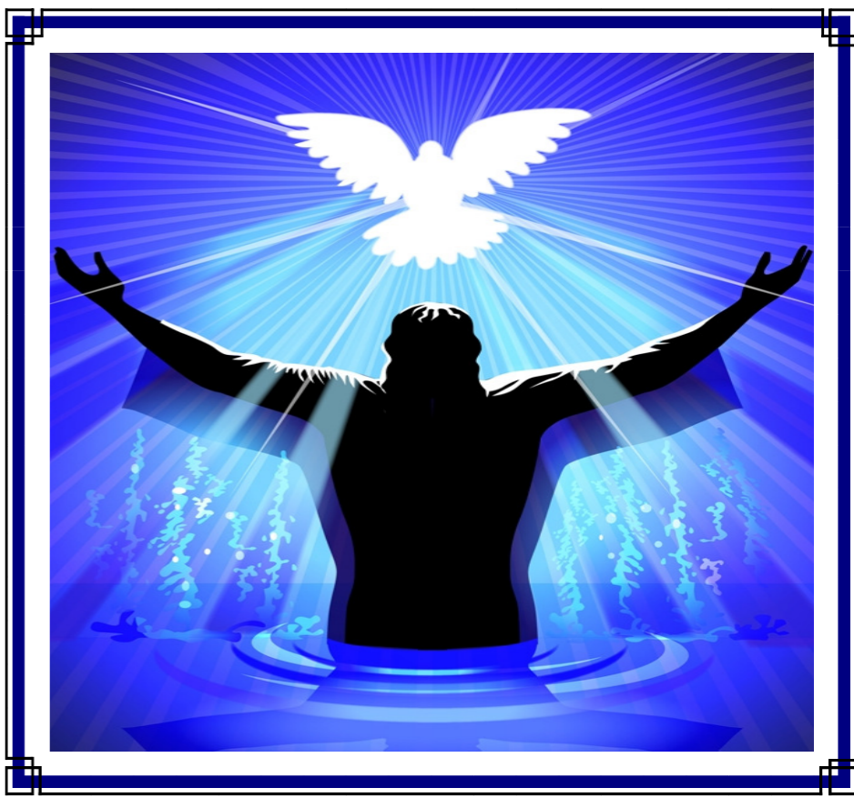
Jesus, The Christ

501-7 Mitchell Street • Atlanta, Georgia 30314 (M. L. King Jr. Drive, SW & Northside Drive) Office 404.524.4263 Fax 404.524.4344 www.centralumcatl.org