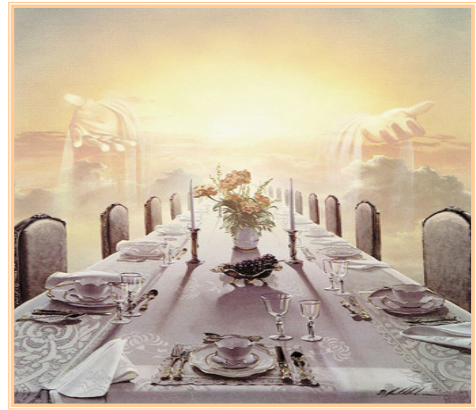
The Parable of the Wedding Feast

501-7 Mitchell Street • Atlanta, Georgia 30314 (M. L. King Jr. Drive, SW & Northside Drive) Office 404.524.4263 Fax 404.524.4344 www.centralumcatl.org